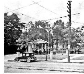
Accurate Oil Company E. Main St. & Parkview Ave. circa 1925

This past summer the Giant Eagle Corporate Headquarters in Pittsburgh contracted the Bexley Historical Society with an inquiry about Bexley businesses from years past. The society provided 30+ photos along with a brief history of each from which selections were made as to the ones the store's artist would interpret for display. The framed art work can be seen in the northeast entrance area and also on the east wall adjacent to the check-out facilities.