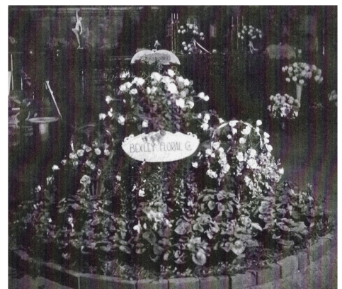
Floral Show, OH State Fairgrounds, c.1930s Bexley Floral Company display

A side note: The Big Bear Supermarket Chain was founded in Columbus in 1933. This marked the beginning of self-service supermarkets in the Midwest. After 75+ years, Big Bear grocery stores closed.