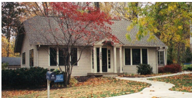
Bexley Historical Society Museum at the Jeffrey Estate Caretaker's Cottage

Bexley Historical Society P.O. Box 9285 Bexley, OH 43209