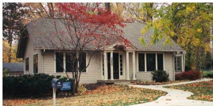
Bexley Historical Society Museum at the Jeffrey Estate Caretaker's Cottage

Bexley Historical Society P.O. Box 9285 Bexley, OH 43209