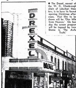
Drexel Theatre Columbus Dispatch December 24, 1937